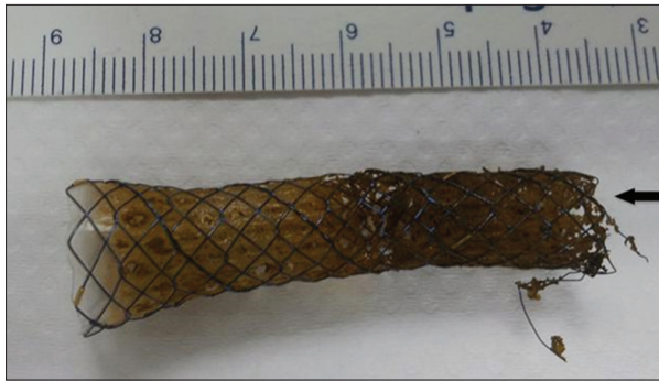
Figure 3: Fractured stent after removal. Arrow points to the fractured end of the stent

both benign and malignant causes of biliary obstruction. These have improved patency and have advantage of being removable. [3,4] Spontaneous biliary stent fracture is very rare complication and is described in only few case reports. [5-10] Previous case reports either describe fracture of stent placed for benign indication [5] or for radiologically placed stents. [6-8] Alkhiari et al. reported stent fracture at the time of removal while pulling stent. [9]