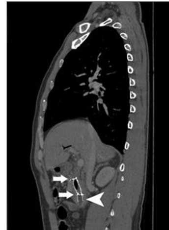
Figure 1: Computed tomography image of the fractured biliary stent: Arrows point to the markings at the proximal end and middle of the stent; Arrow head points to the absence of markings on the distal end of stent due to the fracture of distal portion of stent